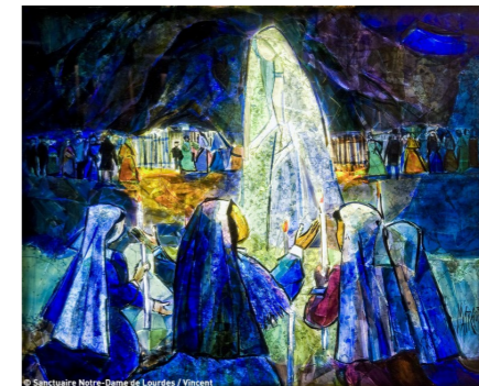
Sanctuaire Notre-Dame de Lourdes

Linking Eloquent and Truthful to artwork.